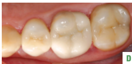
This patient wanted these three worn amalgam restorations (A) replaced. They were removed and the teeth were prepped for