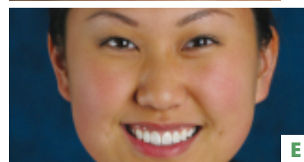
This patient didn't like her gummy smile and prominent centrals (A & B). CEREC veneers for the laterals were designed, milled, stained, and glazed (C). The veneers, along with gingival recontouring and whitening, dramatically improved the smile (D & E).

exactly where you want these colors to be on the restoration. There's a great choice of materials that we didn't have just a few years ago.